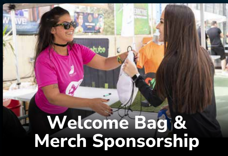
Welcome Bag & Merch Sponsorship