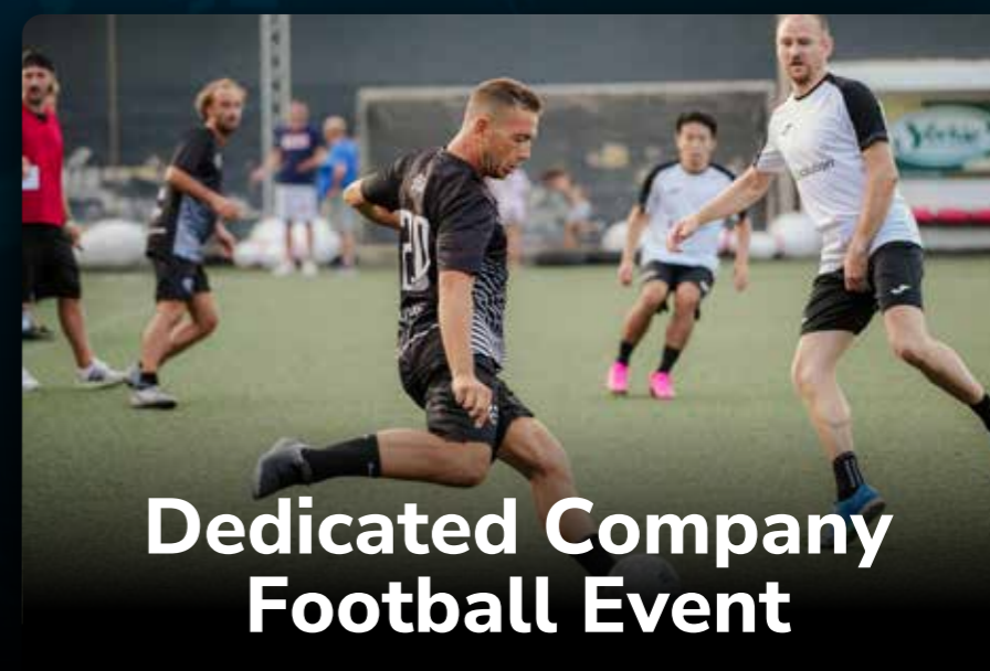
Dedicated Company Football Event