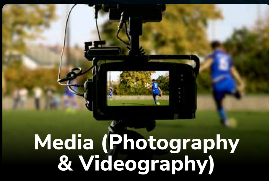
Media (Photography & Videography)