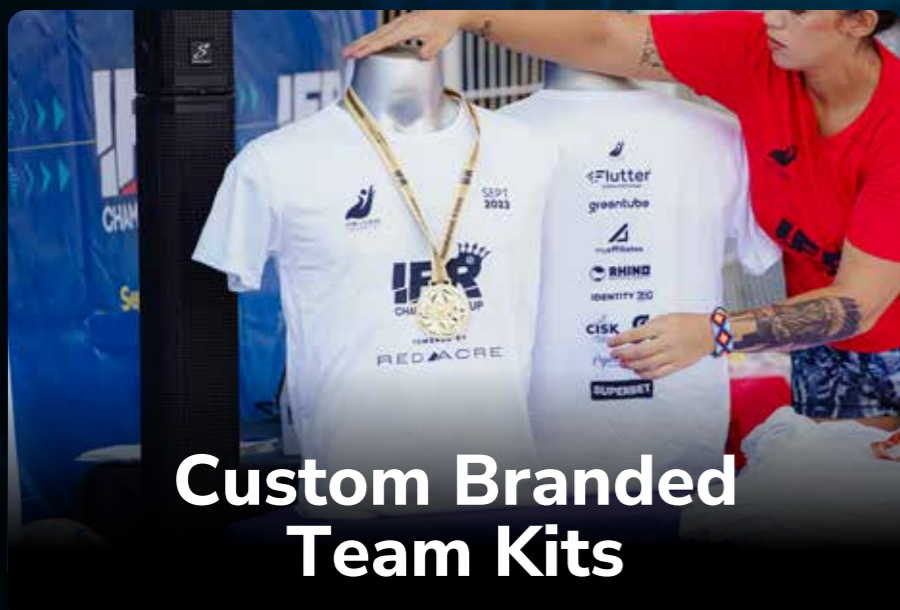
Custom Branded Team Kits