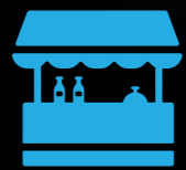
Food & Beverage Stalls