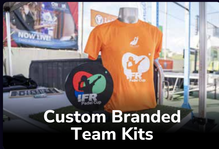
Custom Branded Team Kits