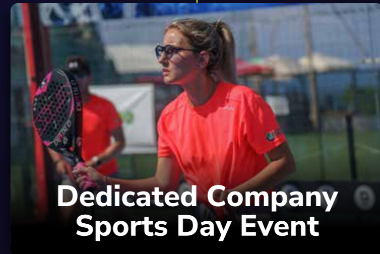
Dedicated Company Sports Day Event