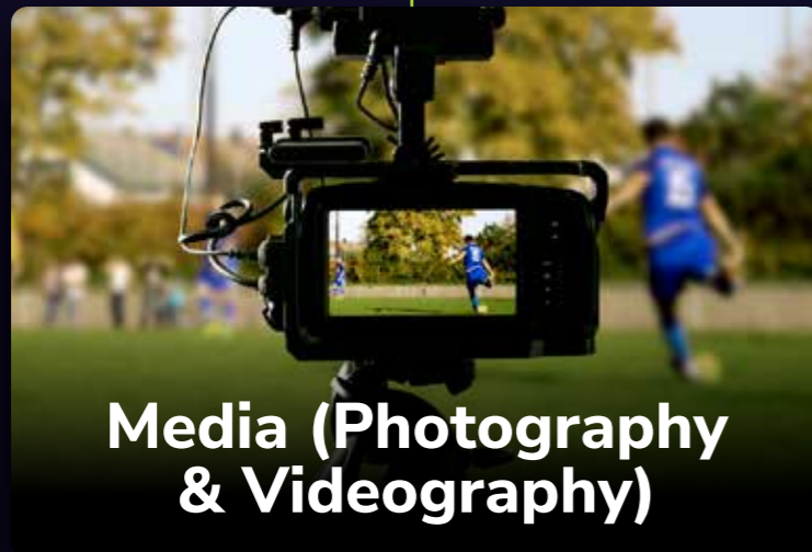
Media (Photography & Videography)