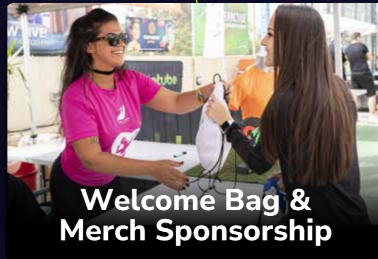
Welcome Bag & Merch Sponsorship