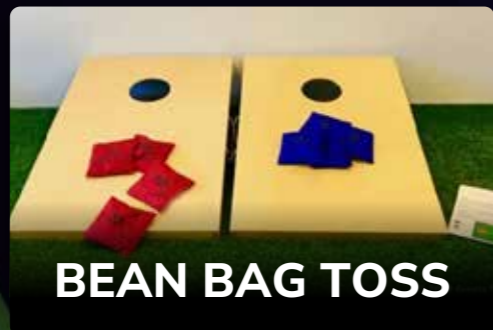
BEAN BAG TOSS